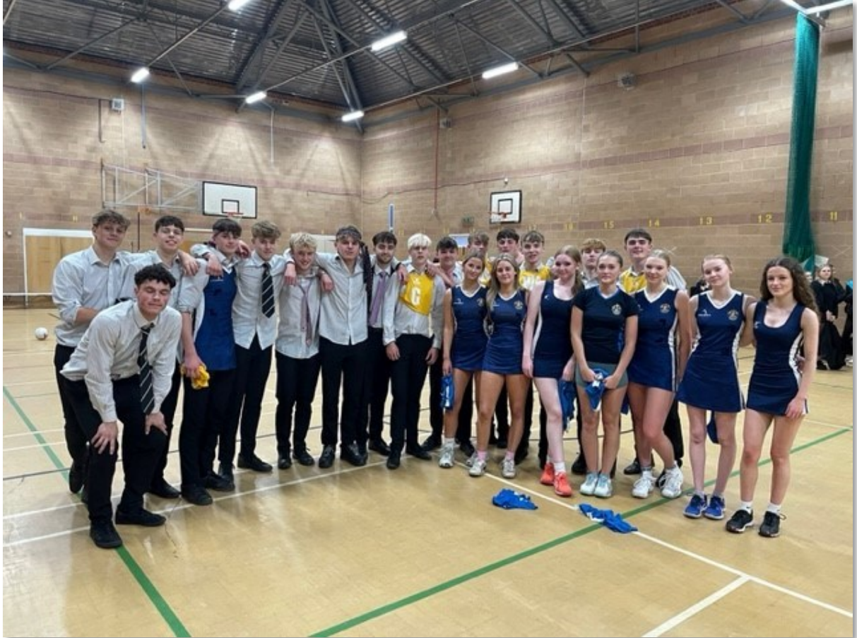
Wear it Pink charity netball match. The girls won!

So far this half term, Sixth Formers have raised: